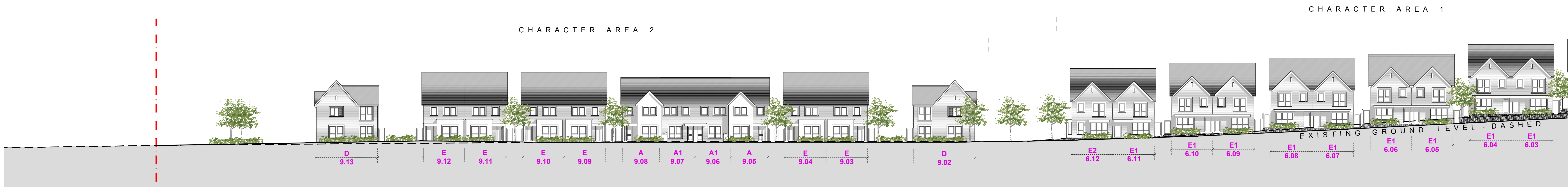
Section CC 2 1:200 @ A0