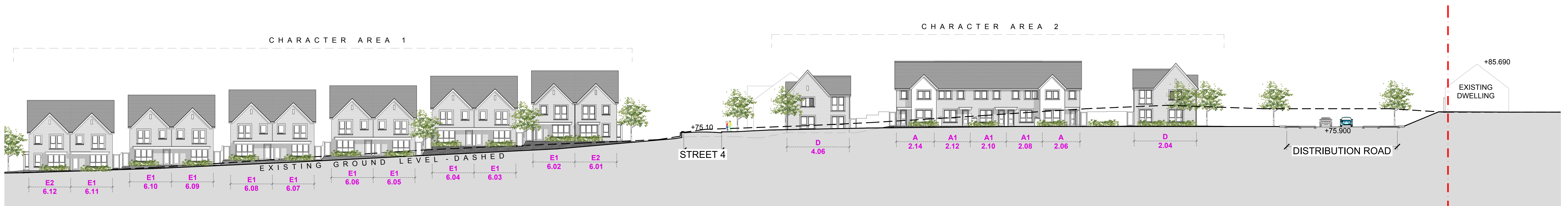
Section CC 1 1:200 @ A0